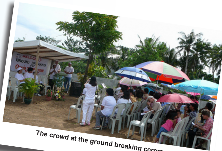
The crowd at the ground breaking ceremony.

Email: john7nilda@yahoo.co.uk • Website: www.oasisorphanage.com