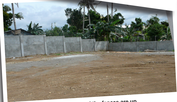
The site is cleared the fences are up.