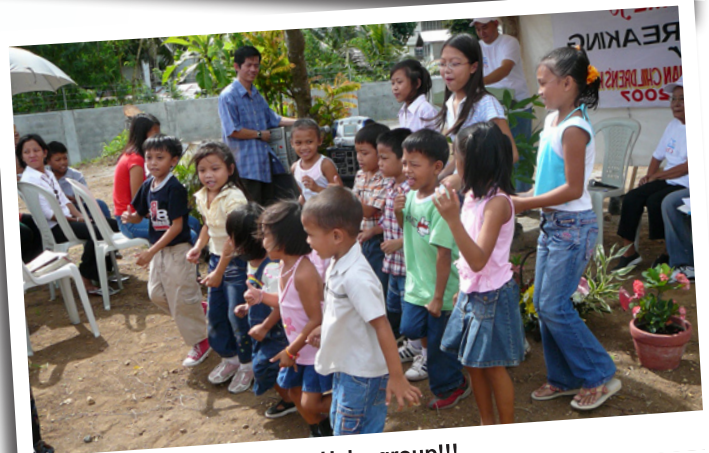
The Haka group!!!