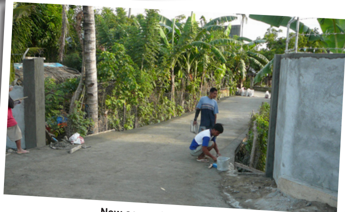
New concrete access road.